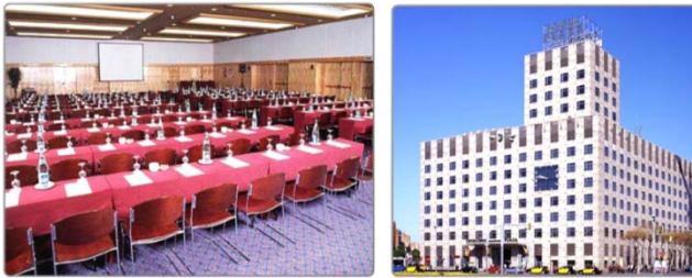
Hotel Catalonia Barcelona Plaza